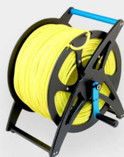
Tether Reel Surface